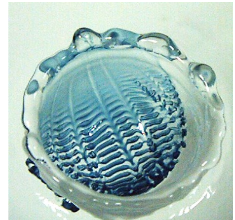
Regular flow structure of compound drop impact with water (Fluid Dynamics, 2024)